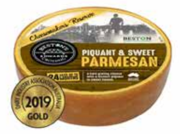
Beston's Edwards Crossing Natural Parmesan 6kg Round