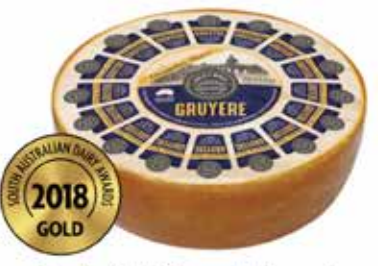
Beston's Edwards Crossing Natural Gruyere 6 kg Round