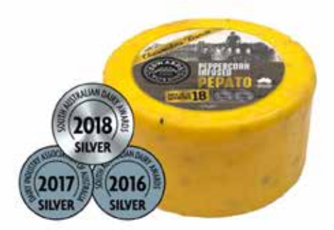
Beston's Edwards Crossing Waxed Natural Pepato 4.9kg Round