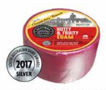
Beston's Edwards Crossing Natural Edam 2.3kg Round