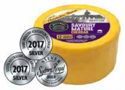
Beston's Edwards Crossing Savoury Mature Cheddar 2.3kg Round