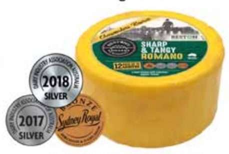
Beston's Edwards Crossing Waxed Natural Romano 4.9kg Round