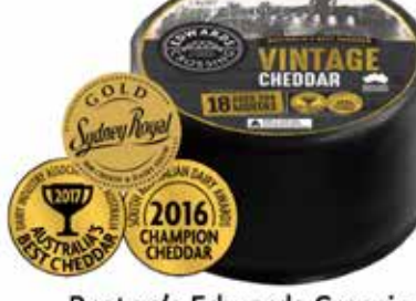
Beston's Edwards Crossing Vintage Cheddar 'Best in Australia DIAA 2019/2017' 2.3kg Round