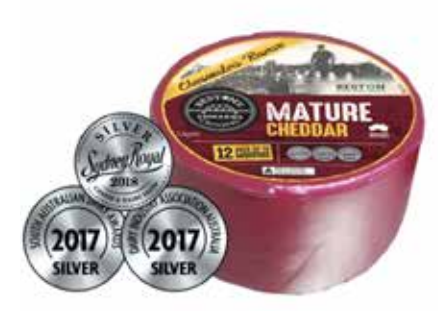
Beston's Edwards Crossing Mature Cheddar 2.3kg Round