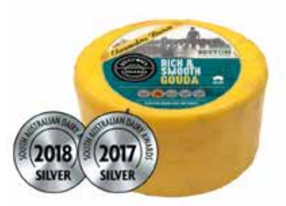
Beston's Edwards Crossing Natural Gouda 2.3kg Round